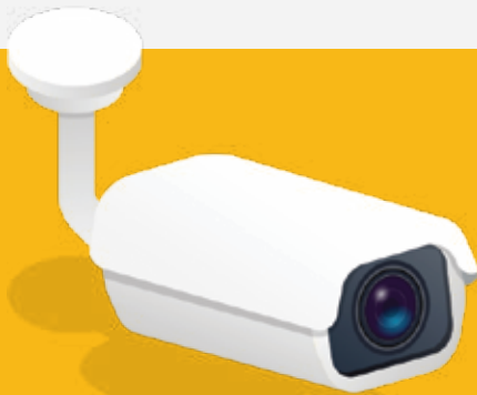
Comprehensive Risk Detection

Equipped with over 20 powerful AI algorithms , it accurately detects critical life-threatening patterns such as fire, smoke, weapon possession, falls, and trespassing within the golden time and triggers immediate alerts.