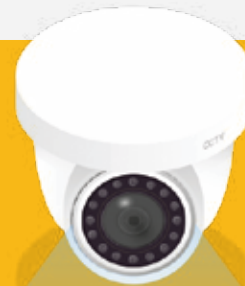
Top-Level Independent Security Environment

Equipped with over 20 powerful AI algorithms , it accurately detects critical life-threatening patterns such as fire, smoke, weapon possession, falls, and trespassing within the golden time and triggers immediate alerts.